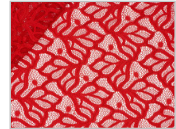
30 rosso red