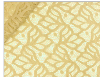
35 carne skin