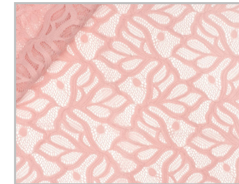
20 rosa pink