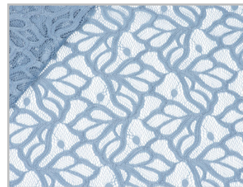
70 celeste light blue