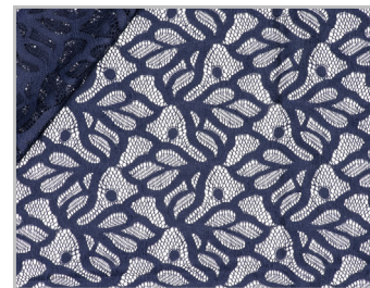
40 blu blue