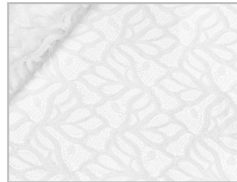
10 bianco white