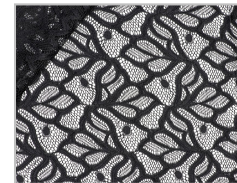
50 nero black