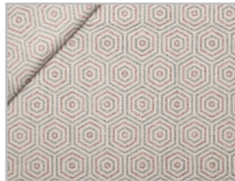
67 esagoni porpora purple hexagon