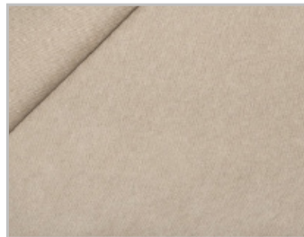
71 beige beige