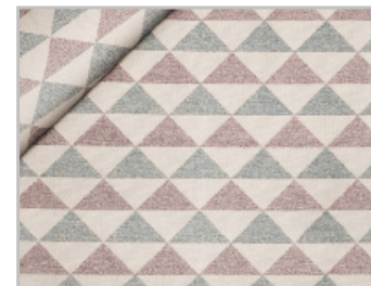
65 triangoli porpora purple triangle