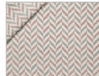
66 zig zag porpora purple zig zag