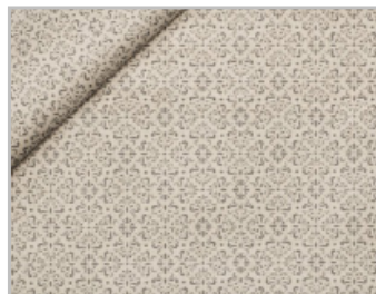
64 giglio grigio grey lily