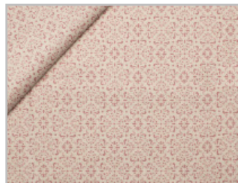
63 giglio rosa pink lily