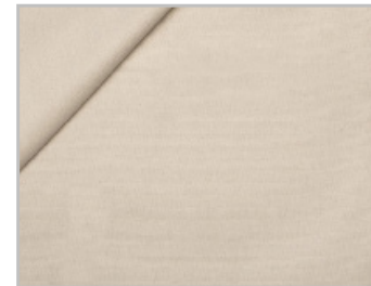
72 naturale natural