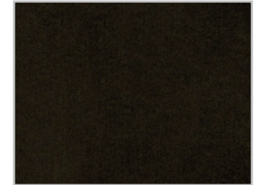
724 marrone medio medium brown