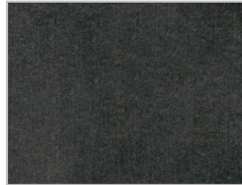
712 grigio scuro dark grey