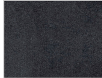
713 antracite anthracite